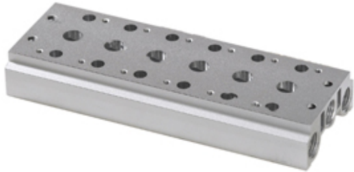
6-Station Manifold for 4-Way for MME/MMA-43 Series Valves