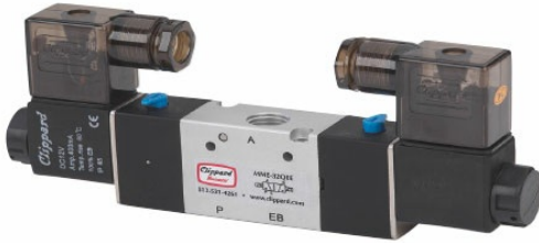
#10-32 3-Way Double Solenoid Valve, 220 VAC DIN