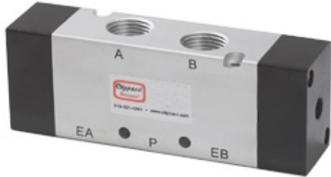
#10-32 5 Port 4-Way Dbl. Pilot Actuated Air Valve