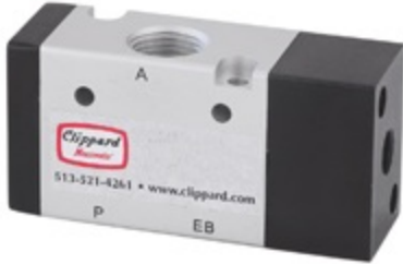
1/2" 3-Way Double Air Pilot Valve