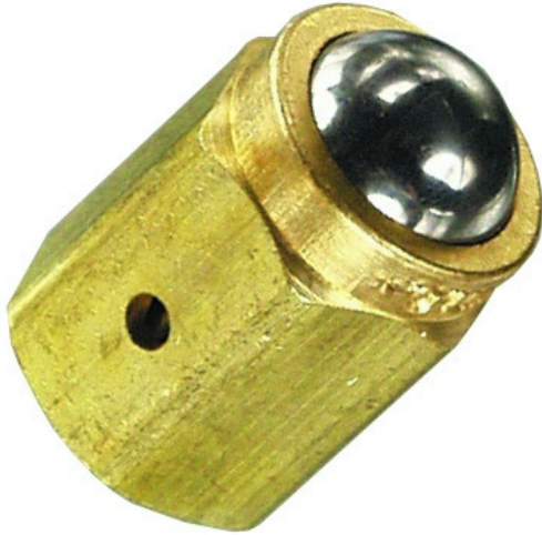
Ball Cam Actuator