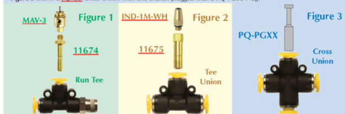
Figure 3 shows a PQ-CU Cross Union with one branch plugged with a PQ-PG08 Plug.

Figure 2 shows an IND-1M-WH Pressure Indicator connected to a PQ-TU08 Tee Union using a 11675-08 Adapter. If one of the branches of a Push-Quick Fitting is to be used as a temporary pressure gauge port, the PQ-PGXX series of Plugs can be used when the gauge is not in place. Plugs may also be used if Push-Quick Fitting branches are intended for future additions to the circuit, but have no current need.