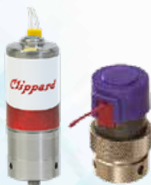
Clippard's proven M-DVP and M-EVP proportional valves provide fast, stable control of pressure

Equipment used for test and calibration is NIST Traceable