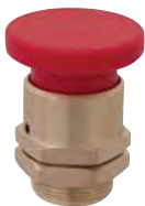
Part No. Description PC-3M-(color) 5/8-32 Thd., Mushroom (specify color)