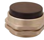
Part No. Description PC-5E-(color) 1 3/16-28 Thd., Extended (specify color)