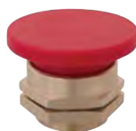
Part No. Description PC-4M-(color) 7/8-32 Thd., Mushroom (specify color)