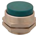
Part No. Description PC-4E-(color) 7/8-32 Thd., Extended (specify color)