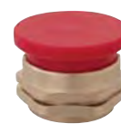
Part No. Description PC-5M-(color) 1 3/16-28 Thd., Mushroom (specify color)