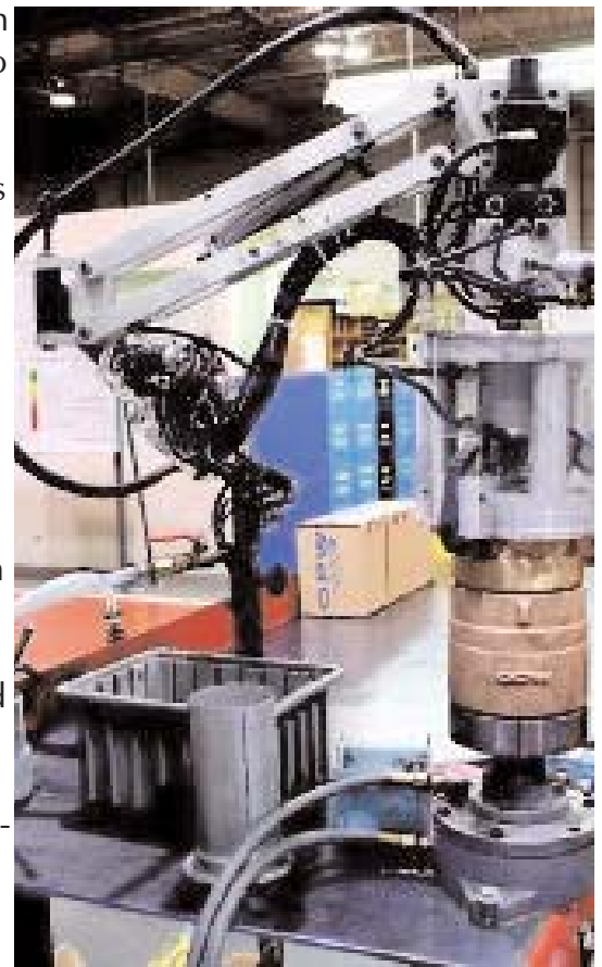
An inexpensive pneumatic rotary actuator provides accurate torque testing of brass swivel adapters. The unit is more precise than a torque wrench and considerably less expensive than electronic torque testers.

Conservation turned out to be a better option. One problem was that air pressure throughout the plant was largely unregulated, with various systems ranging from 70 to 100 psi. "First, we regulated the entire plant at 85 psi, so everything from blow-off guns to presses were now using less air, wasting less energy, and significantly cutting demand," he says.