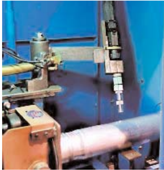
Pneumatic actuators and air logic let OPW automate MIG welding processes. Part quality exceeds Six Sigma.

tester accepts parts that move and rejects those that don't, whether due to a defective part or a system failure. Thus, it can never accept a bad part. And because air is compressible, there is no risk of a too-tight part damaging the system.