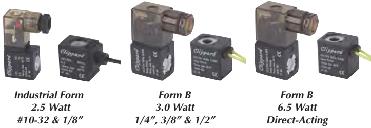
Industrial Form 2.5 Watt #10-32 & 1/8"